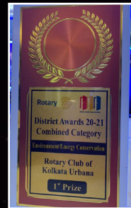
Environment / Energy Conservation under Combined Category