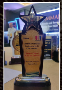
Samagam District Conference

CLUB EXHIBIT District Governor's Appreciation